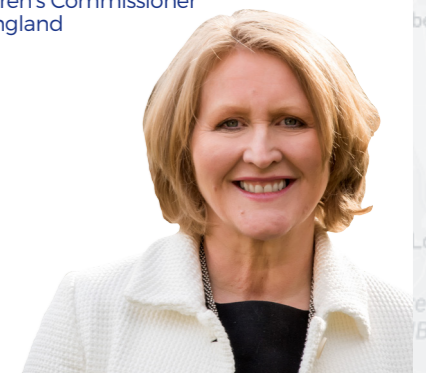
Anne Longfield, OBE Children's Commissioner for England

That's why I want children to be at the heart of the regeneration debates. I want every child to have the brightest future possible, wherever they live.”